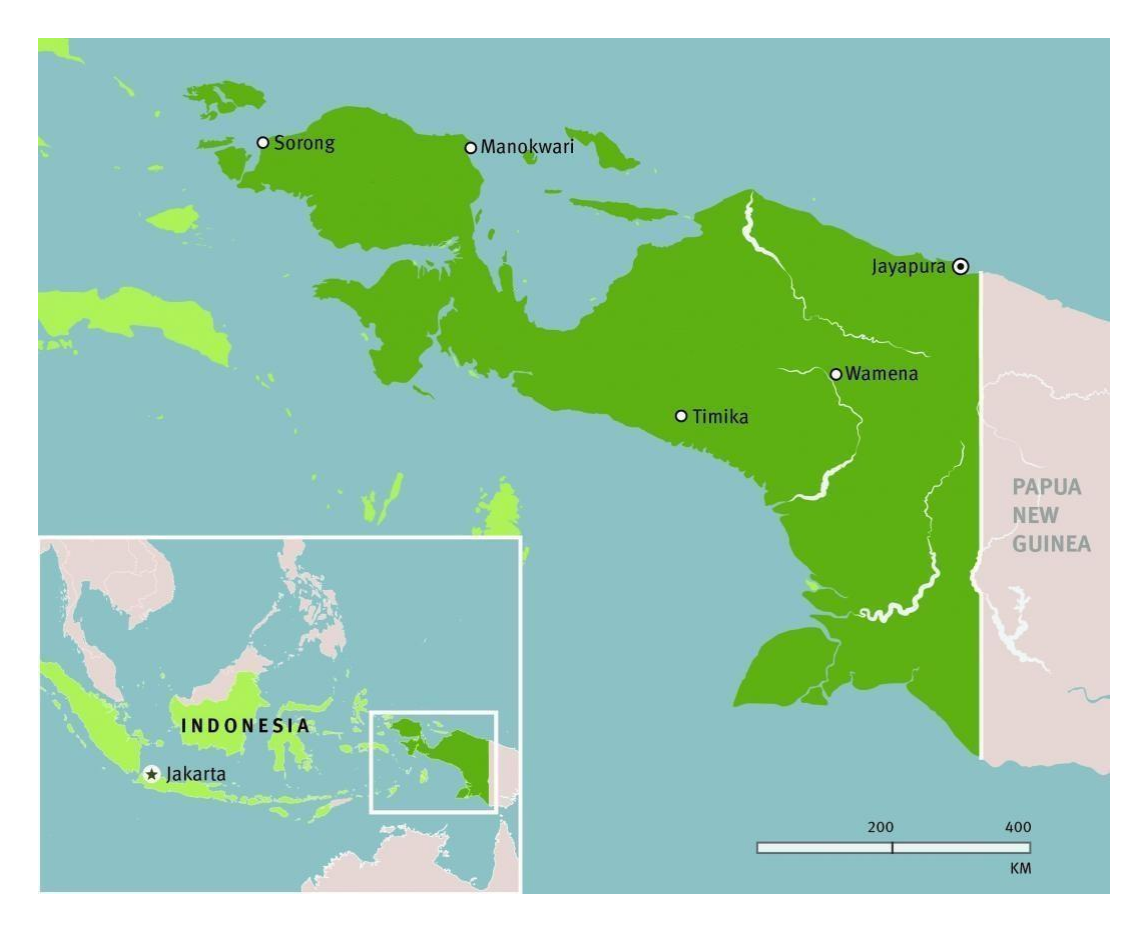
Figure 1: The territory of West Papua

The territory of West Papua refers to the Western half of the island of New Guinea, partitioned as a result of European colonial settlement. West Papuans, an Indigenous Melanesian people, have been engaged in a struggle for their right to self-determination since colonisation by the Netherlands in 1898. Just like the Amazon, this area of critical value to the sustainability of the planet is now under threat from extractive industries and the many Indigenous tribes find their ways of life increasingly violently disrupted.